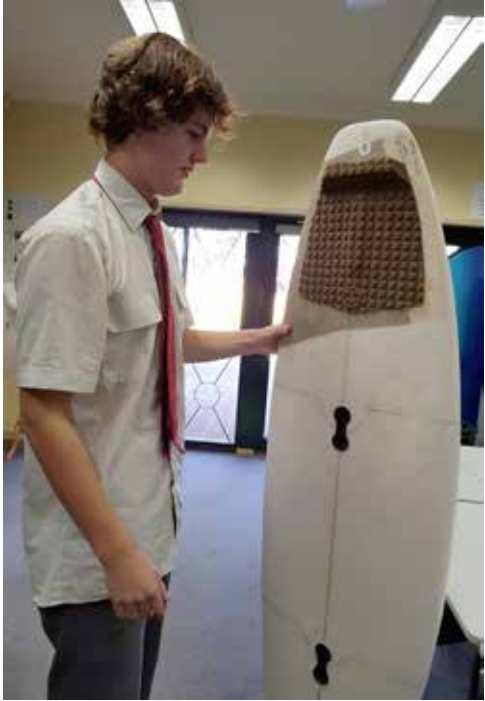
Mobile Surfboard Christopher Kidall Park